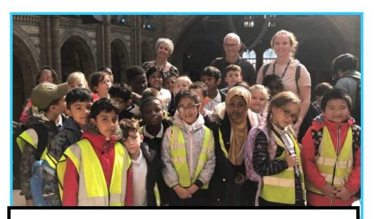
Year 3 went to the Natural History Museum!