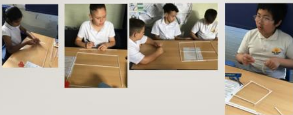
SOME YEAR 5 PROTOTYPE MAKING PHOTOS – WE ARE MAKING CARNIVAL RUCKSACKS

During D&T, year 5 have been working on their carnival prototypes. Year 5 will be making rucksacks. We learnt that a prototype normally looks and works like the real thing. It is the first example and there may be some problems with it which will probably need changing. The prototype model will be used for testing, development and evaluation. We used paper straws and tape to create our structures and then to elaborate on them, using tissue paper / cardboard. We are very excited to start building our actual carnival structures.