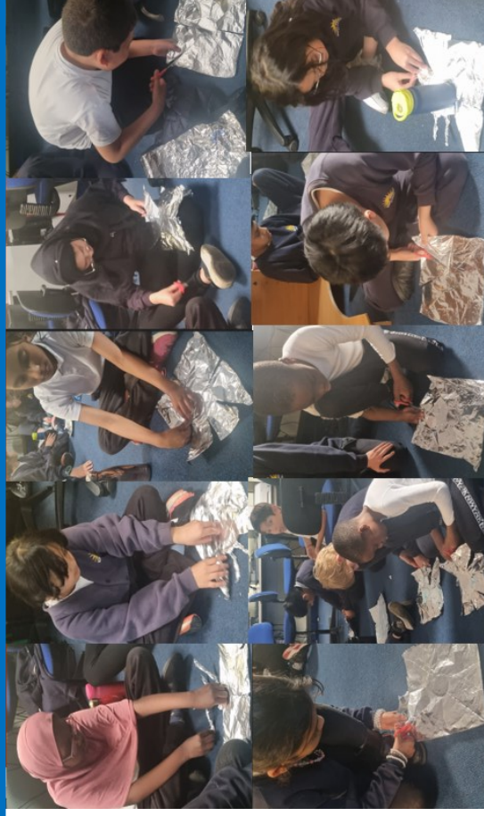
Louise B foil inspired spider sculptures